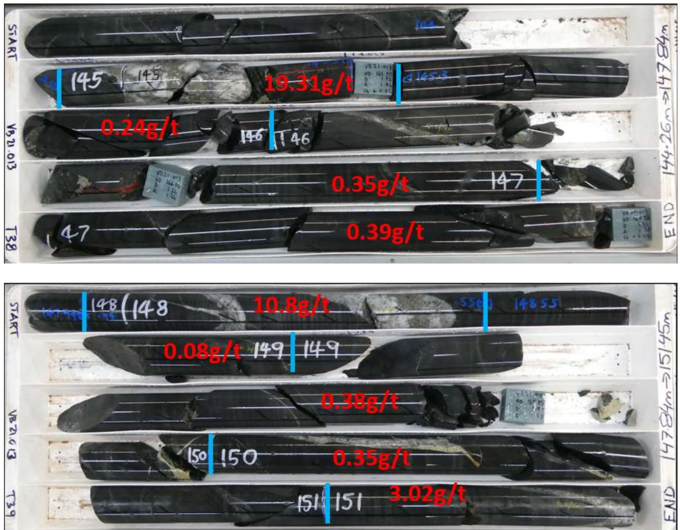
Figure 1 - Plan View of Drill Holes