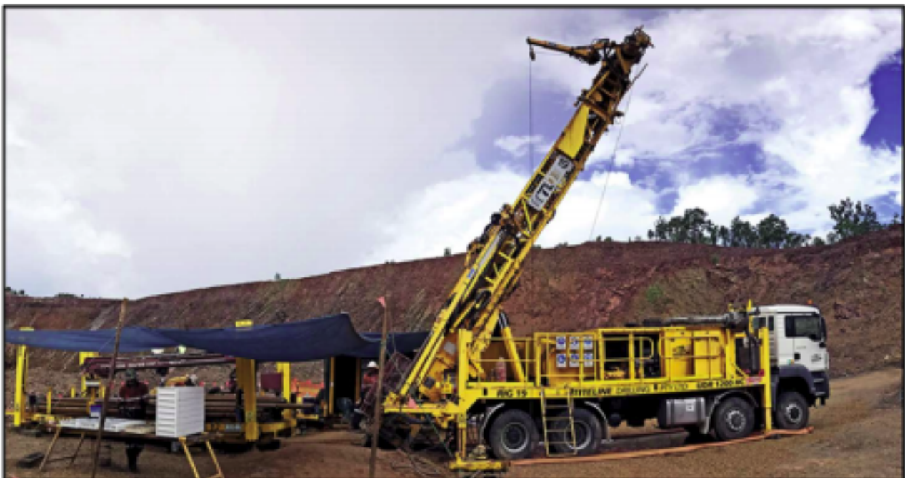
Figure 2 - Exploration Drilling Program

identify areas where future infill drilling will have the greatest potential to add resource ounces close to the Batman deposit.