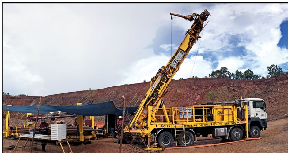
Figure 2 – Exploration Drilling Program

The second phase of drilling, which included 18 holes and approximately 6,000 meters, was completed in August. Holes announced to date have successfully identified several gold-bearing structures that connect the Batman pit and the Golf-Tollis deposit. Assays for the final two holes of this phase, VB21-012 and VB21-013, are expected to be reported later this month. The third phase of drilling, totaling an additional 3,000 meters, has commenced and is expected to continue through year end. The purpose of the current drill program is to identify areas where future infill drilling will have the greatest potential to add resource ounces close to the Batman deposit.