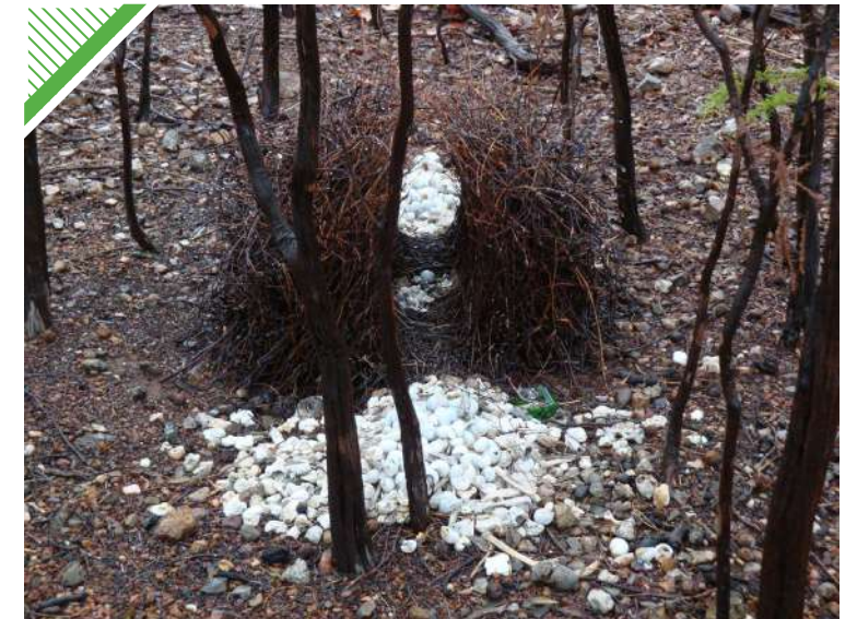
Courting Bower of the Australian Bowerbird